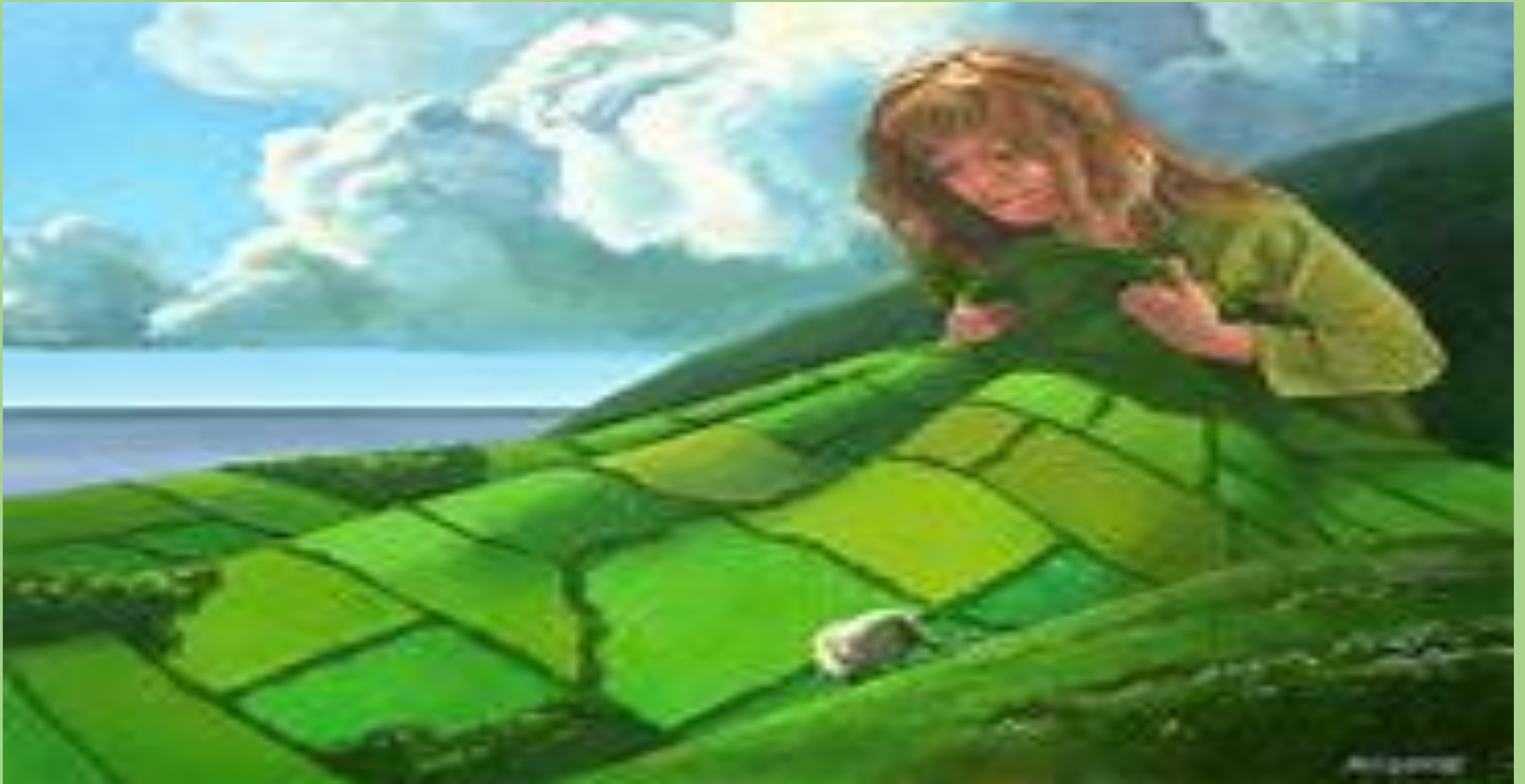
Story of St Brigid's Cloak