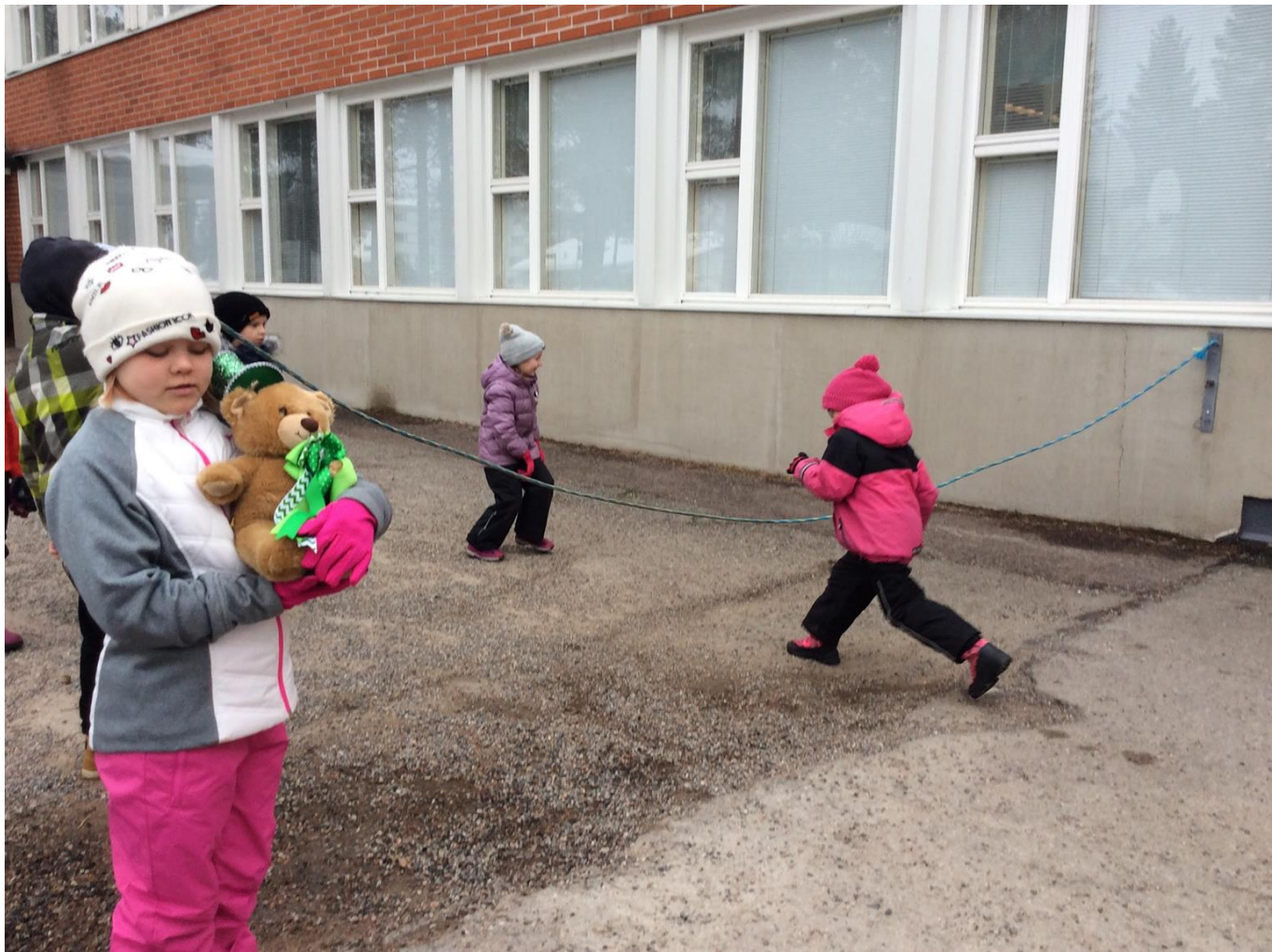
Here I'm at school break.