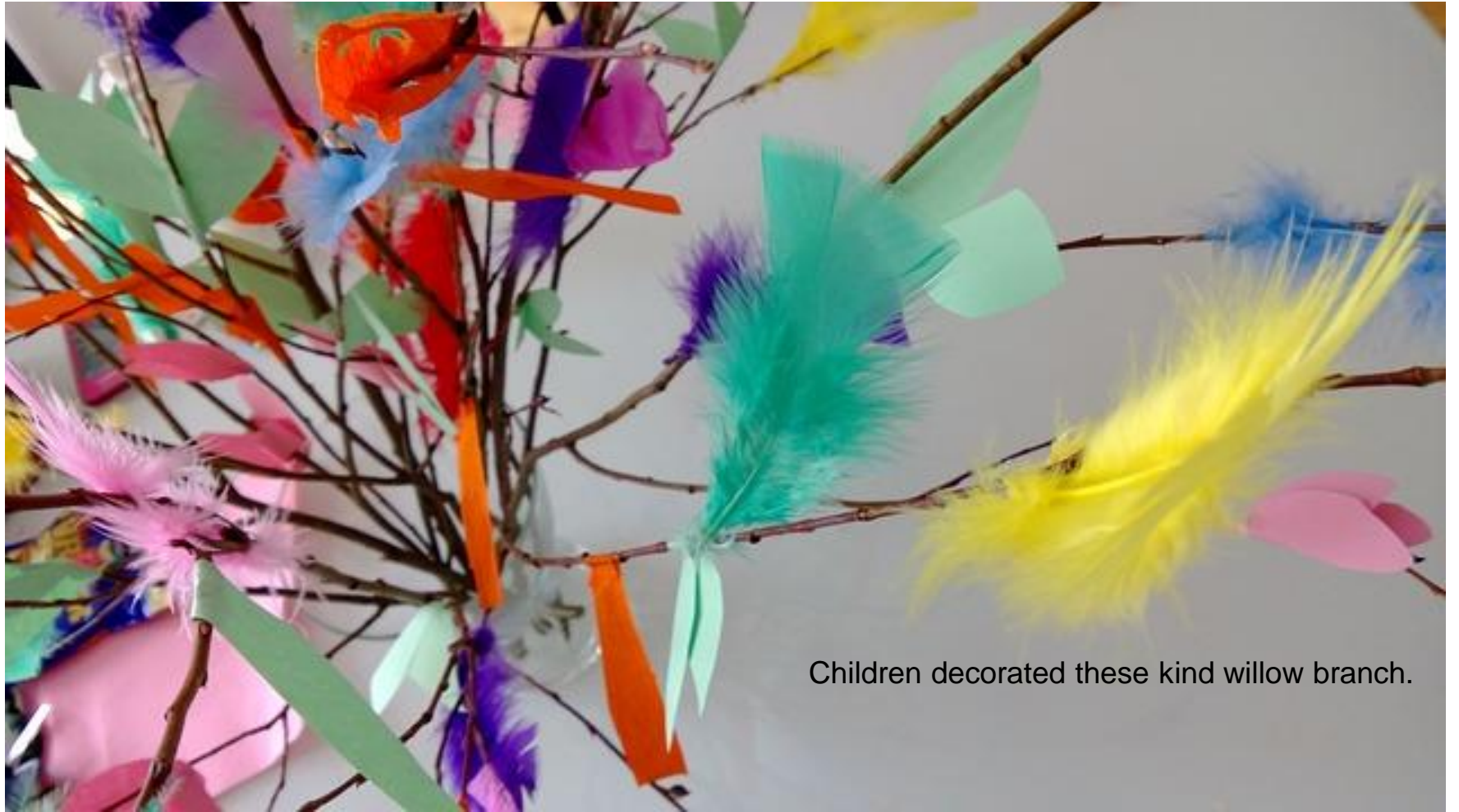
Children decorated these kind willow branch.